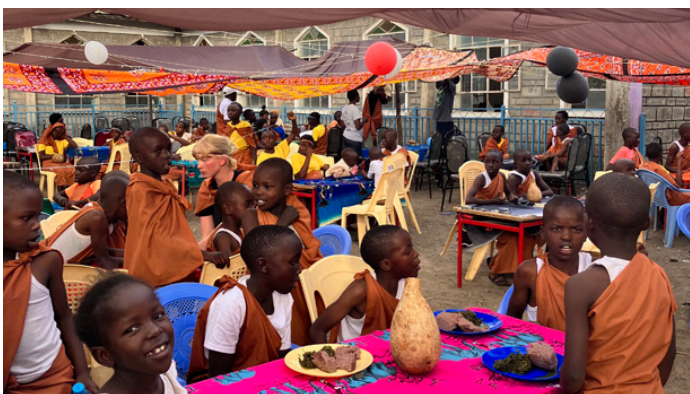
Cultural festival for children

I lost my husband, who was working at NLAI as a cook. He died in a road accident and left me with my daughter, who was three years old. I went through a lot of pain, sadness and was depressed for some years, but thanks to lots of love from the children, colleagues, leaders at NLAI and my church, I came through. As I got over it, I decided to move on with my life together with my daughter.